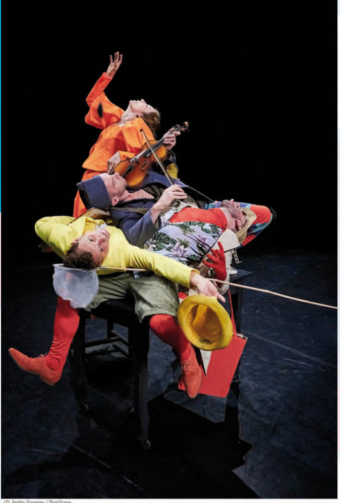
D Agathe Purpency / PhoniScene

Dance, music, theatre, circus, the arts and video are invited to celebrate the centenary of this opera without a singer, the source of the musical. A dreamlike work of fantasy.